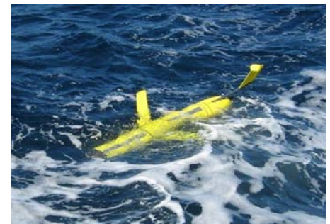
A slocum glider in the water

With a fading battery, it was decided to shut down most instruments and restrict satellite communication to just GPS. Still the glider was stuck in a large eddy and was now 150 nm east of Sydney. Iain and his