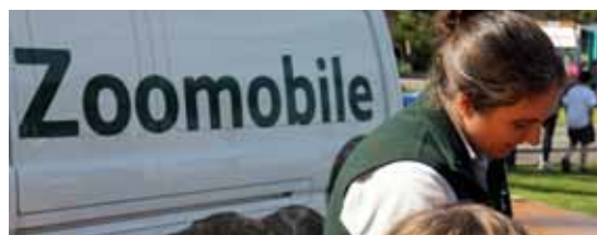
Taronga Zoo Zoomobile at Harbour Hike.

Go to www.sims.org.au and follow the prompts.