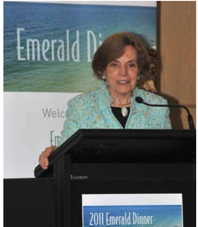
Dr. Sylvia Earle, known around the world as "Her Deepness", addressing guests at the 2011 Emerald Dinner, hosted by our Founding Partner, Sergeants Mess.

1 The TED Prize is awarded annually to an exceptional individual who receives US $100,000 and much more important: "one wish to change the world." See http://www.tedprize.org for full details of the TED Prize.